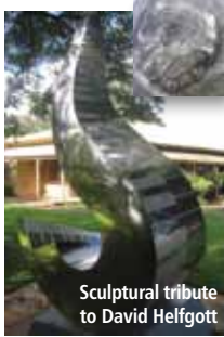
Sculptural tribute to David Helfgott