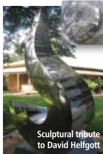
Sculptural tribute to David Helfgott