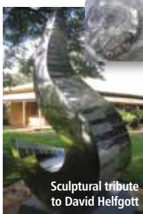
Sculptural tribute to David Helfgott

Venue: Memorial Hall, Hyde St., Bellingen For information please contact Nexus Gallery – details overleaf Ph: 02 6655 9222 Web: www.bcac.org.au