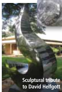
Sculptural tribute to David Helfgott